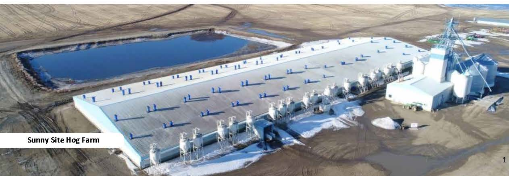
Sunny Site Hog Farm