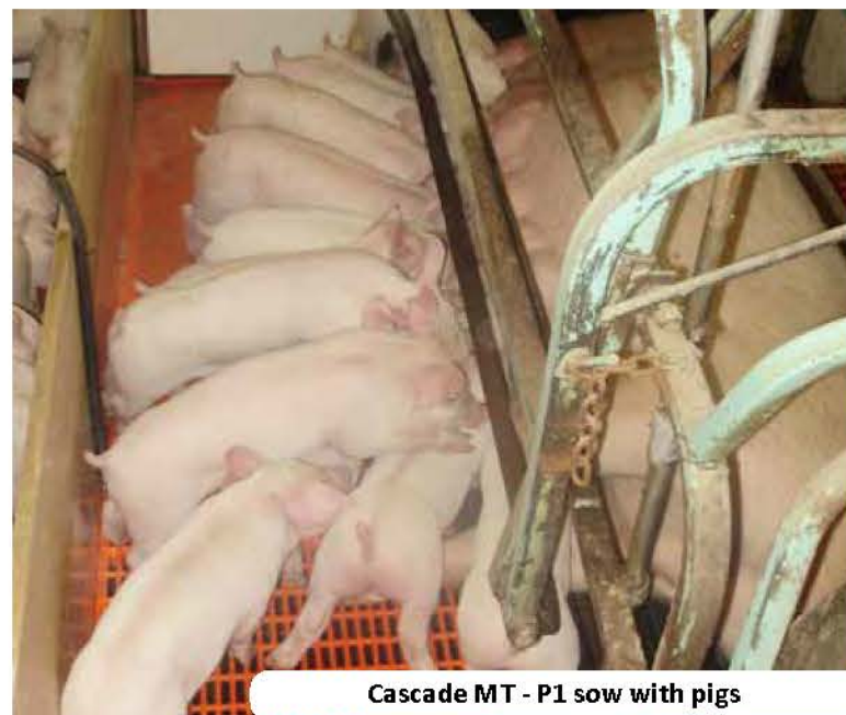
Cascade MT - P1 sow with pigs