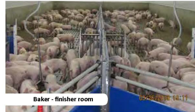
Baker - finisher room