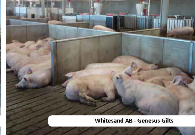
Whitesand AB - Genesis Gilts