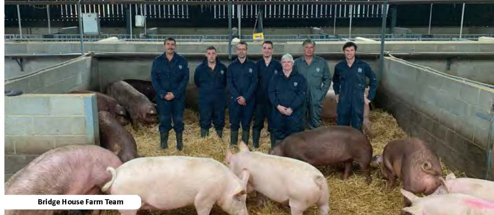
Bridge House Farm Team

"We want to create a team with a balanced quality of life, so we can balance out the night checks and the weekend work. We want to develop a good, interchangeable team that can share the tasks around the farm," he added.