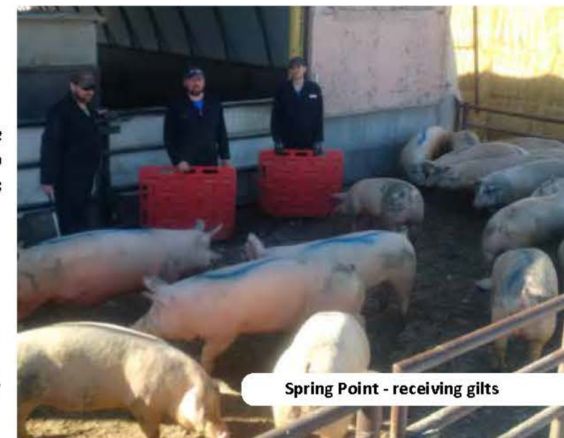
Spring Point - receiving gilts

"We chose to go with Genesis because we have had this genetic at our mother colony for many years and had good success. We believe they have a good growing finisher pig. And a focus to raise meat that grows the pork market."