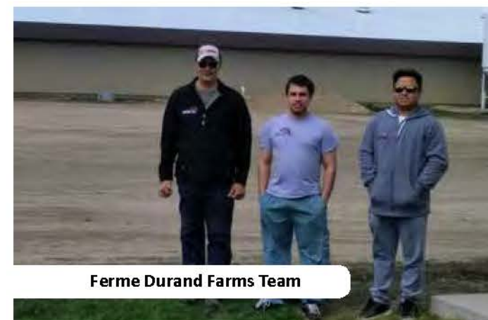
Ferme Durand Farms Team