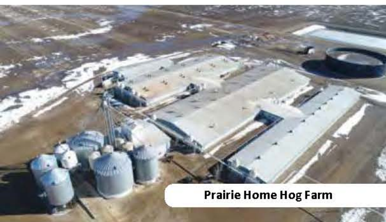
Prairie Home Hog Farm