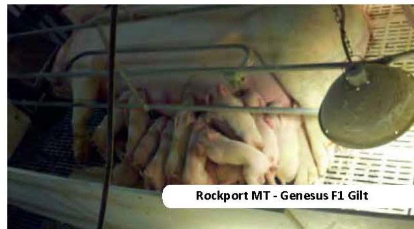
Rockport MT - Genesis F1 Gilt