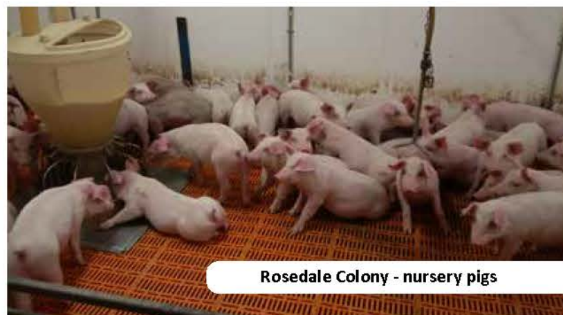
Rosedale Colony - nursery pigs