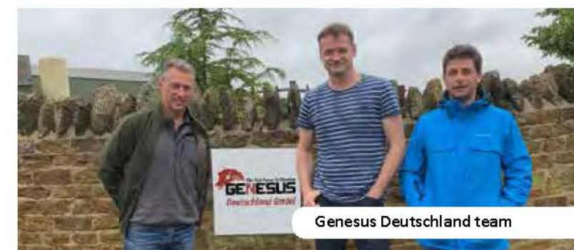
Genesus Deutschland team