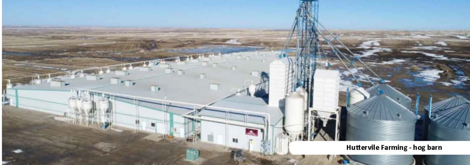
Huterville Farming - hog barn

"Still happy with Genesis pigs. Performing very good for us. Now you know the rest of the story. THANKS !"