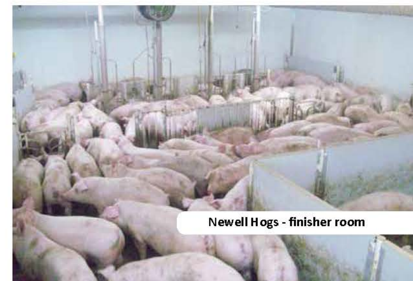
Newell Hogs - finisher room