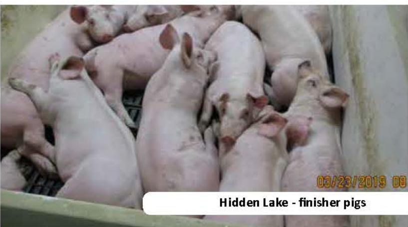
Hidden Lake - finisher pigs