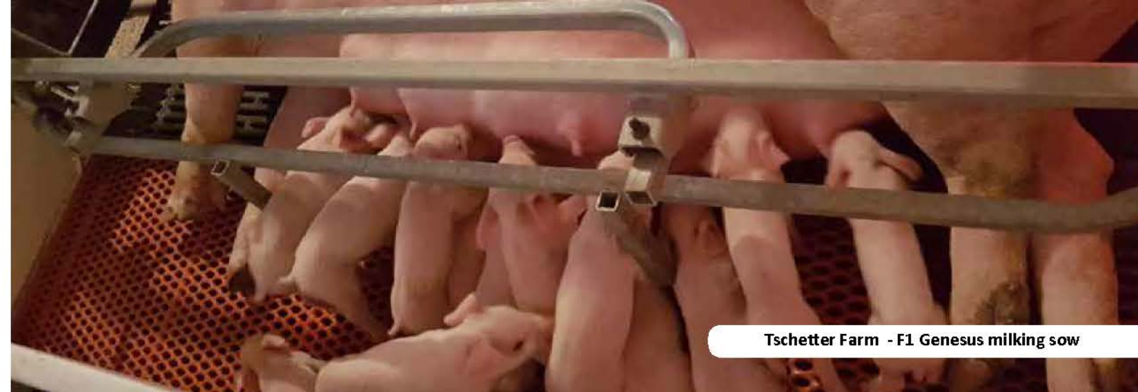
Tschetter Farm - F1 Genesis milking sow