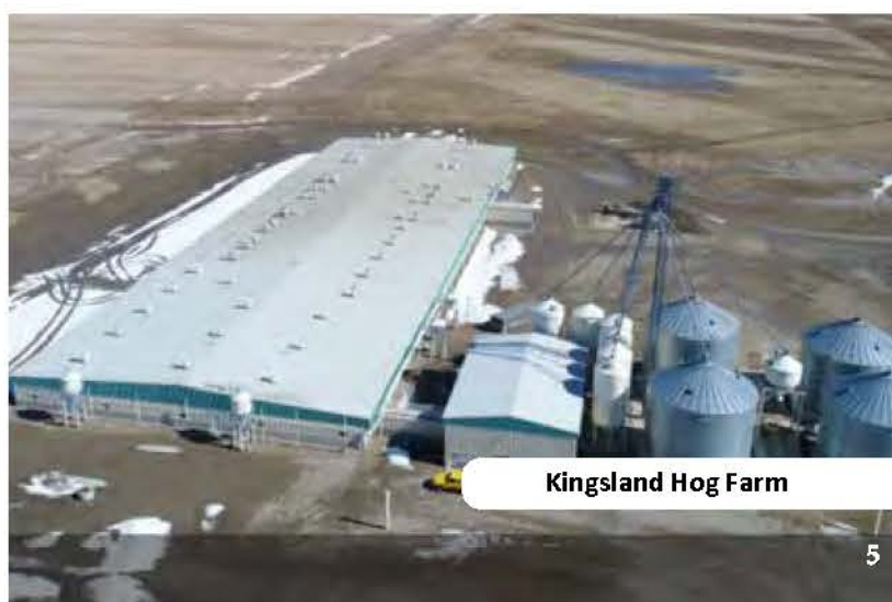
Kingsland Hog Farm