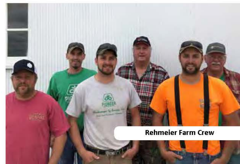
Rehmeier Farm Crew