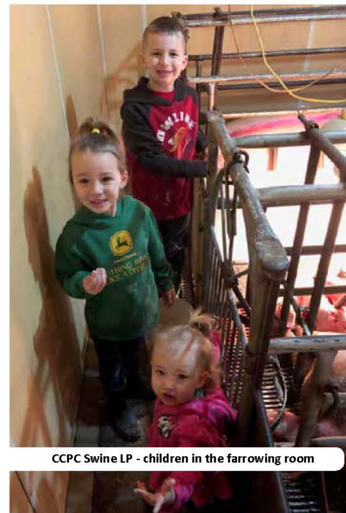
CCPC Swine LP - children in the farrowing room

"The CCPC Swine LP grandkids love seeing newborn piglets enter life. It's easy too, when you know you're going to consistently have 15+ total born with Genesis pigs. Genesis goes way beyond delivering exceptional breeding stock, they also provide end to end expertise in swine production. We appreciate their involvement in brainstorming proposed changes we incorporate in the business and trust their commitment to making our farm successful."