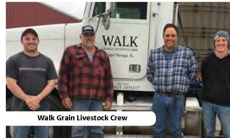
Walk Grain Livestock Crew