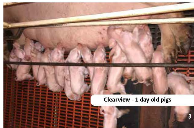
Clearview - 1 day old pigs