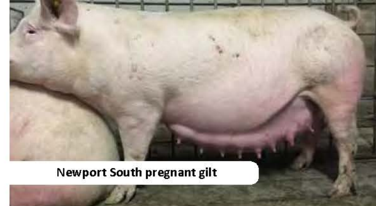
Newport South pregnant gilt