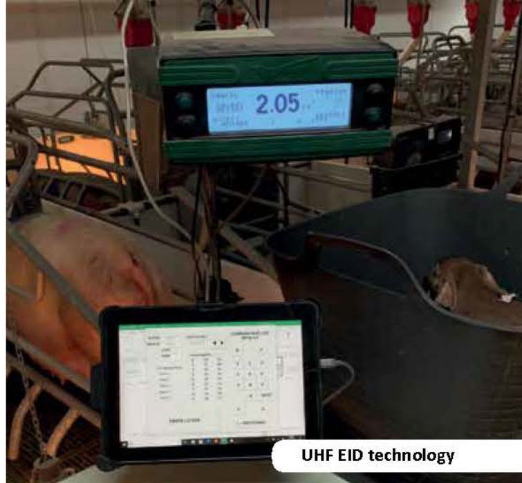
UHF EID technology

Charlie said: "We can't do anything until we've ID'd every piglet born and guaranteed the parentage – everything for us has to happen as soon as possible after birth to provide an accurate birth weight and to ensure the genetics of the dam and sire can be tracked through the system."