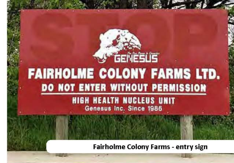
Fairholme Colony Farms - entry sign

"Genesus has a very profitable sow that's easy to manage with high born alive. Days to market are really good."