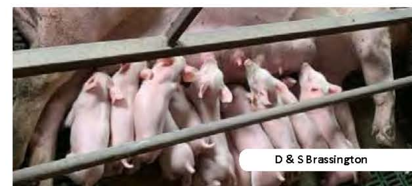
D & S Brassington