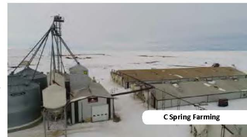
C Spring Farming