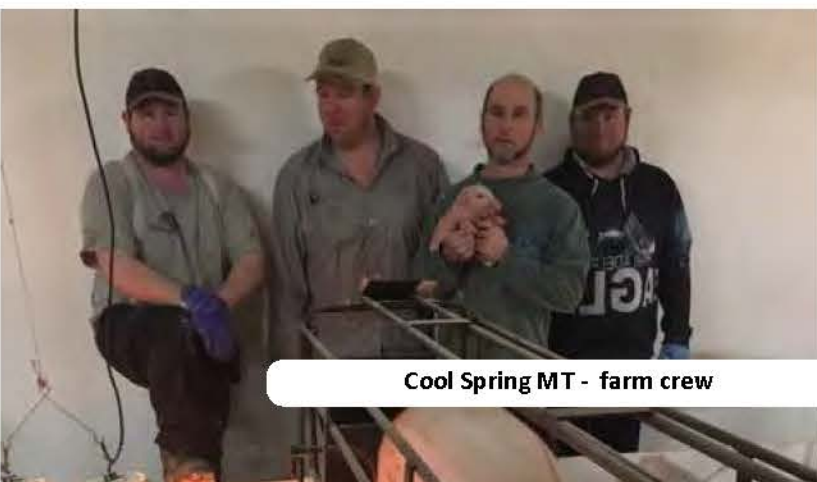
Cool Spring MT - farm crew