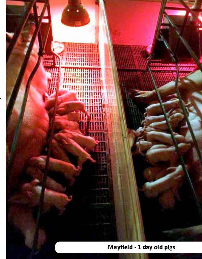
Mayfield - 1 day old pigs

"We have an older unit. The Genesus sow holds up very well in challenging conditions. The Duroc Sire proves to be the leader in Growth."