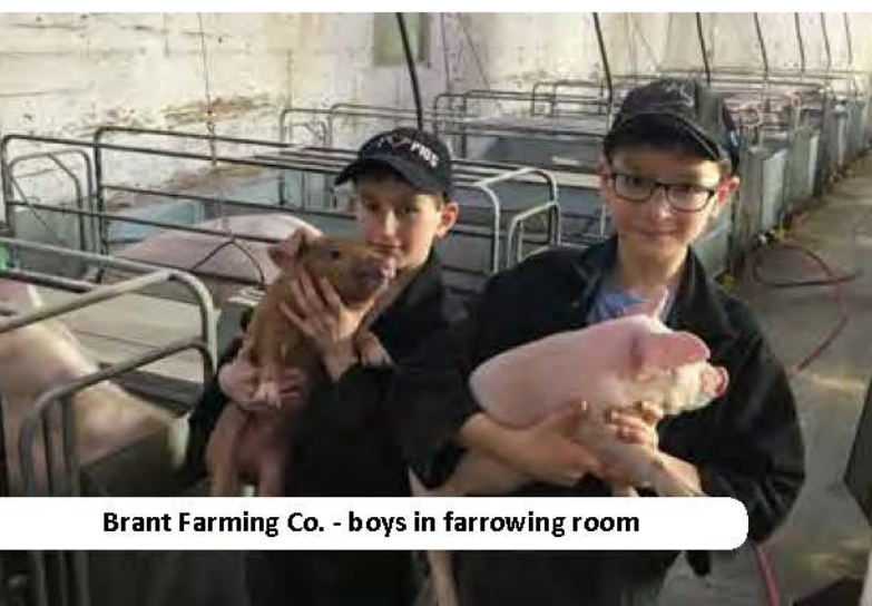
Brant Farming Co. - boys in farrowing room