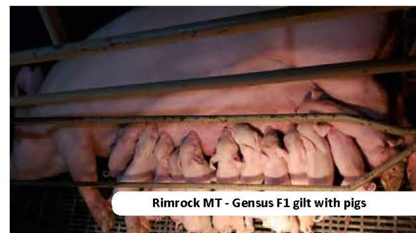
Rimrock MT - Gensus F1 gilt with pigs