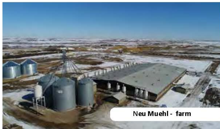
Neu Muehl - farm