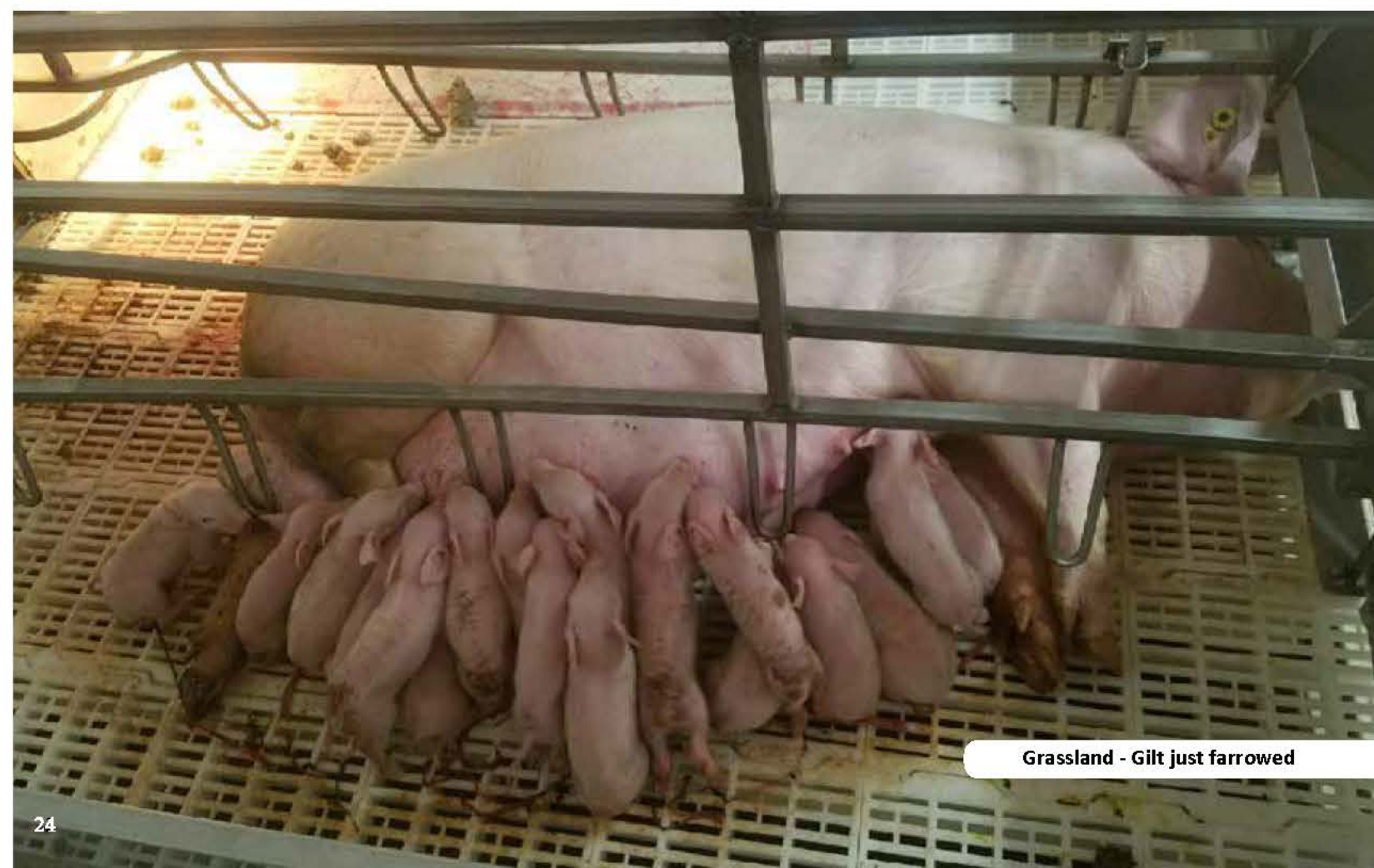
Grassland - Gilt just farrowed