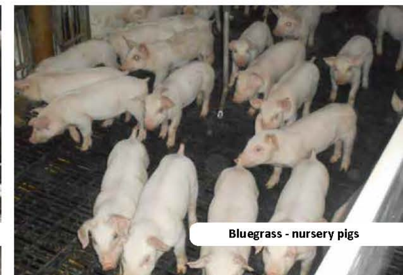
Bluegrass - nursery pigs