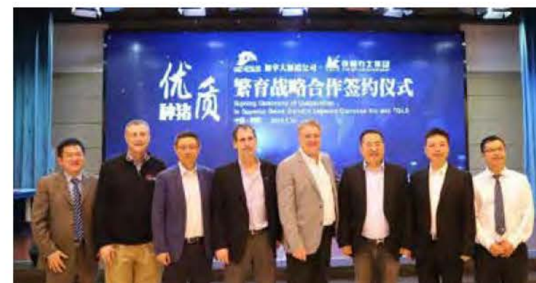
Genesus and customer TQLS at the Signing Ceremony