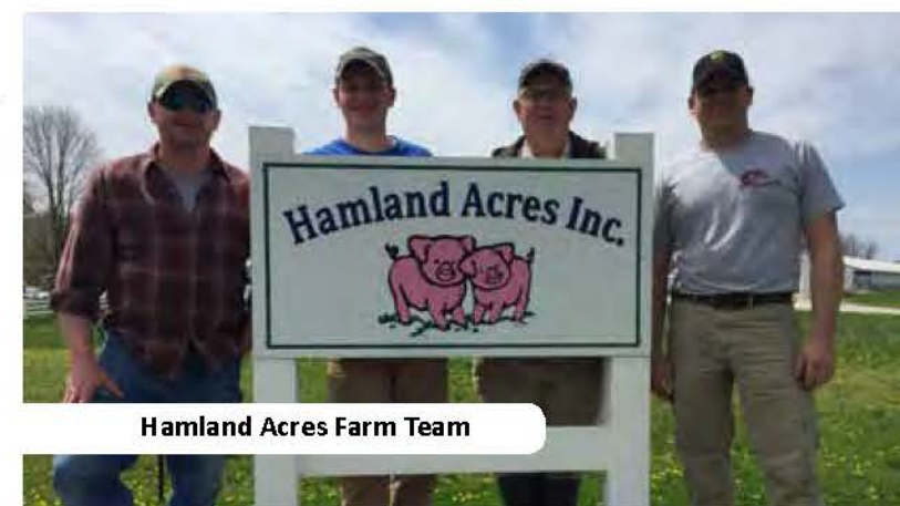
Hamland Acres Farm Team