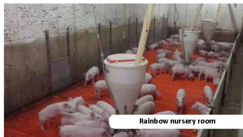
Rainbow nursery room