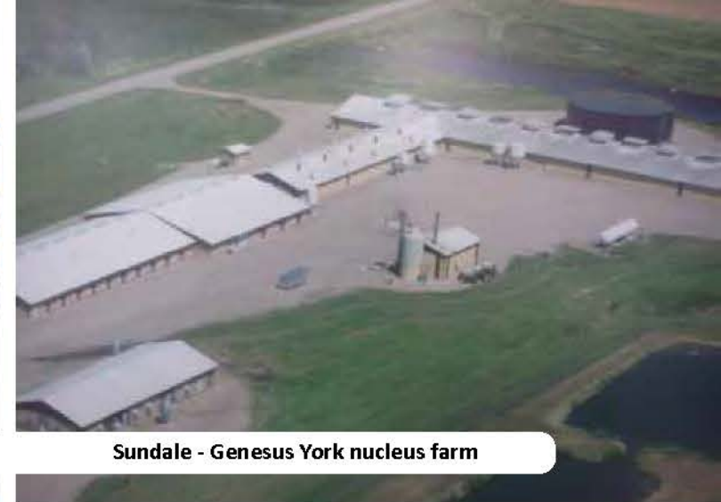
Sundale - Genesis York nucleus farm