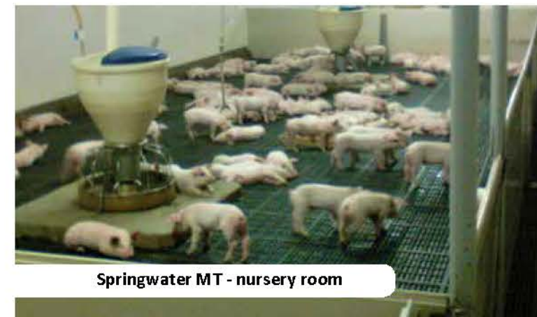
Springwater MT - nursery room